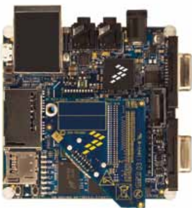
i.MX53 Quick Start board with HDMI module